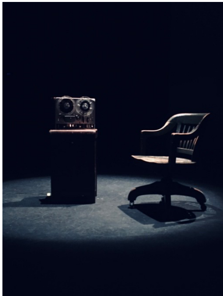
DAR HE: THE STORY OF EMMETT TILL