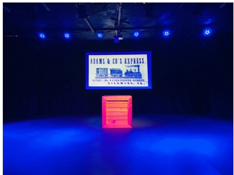
ONE NOBLE JOURNEY: A BOX MARKED FREEDOM