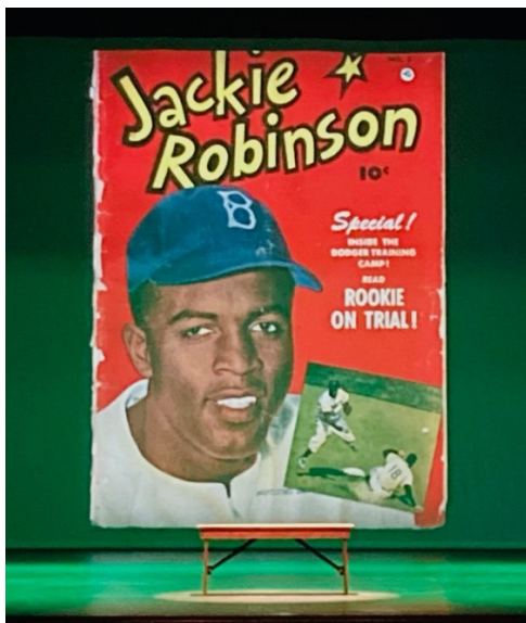
JACKIE ROBINSON: A GAME APART