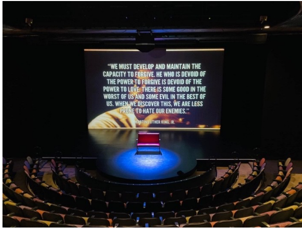
TIRED SOULS: THE MONTGOMERY BUS BOYCOTT